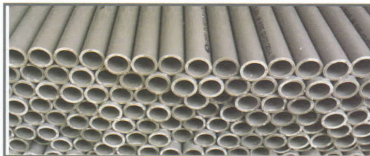
AW and AE uPVC Pipe.

Class VP(AW) pipes are commonly used for factory or industrial application in conjunction with pumps and mechanical plants. Class VU(AE) pipes are used as cable ducting flush pipes, air conditioning water discharge outlet and fume exhaust system.