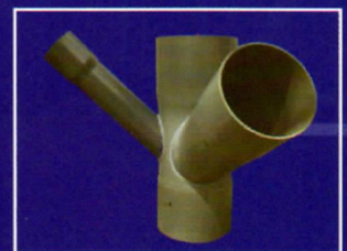
'Y' & 'T' junction