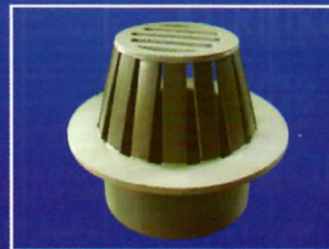
Fabricate grating from 10" to 24"