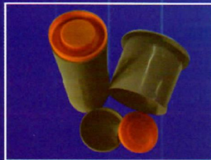
Caps & plugs