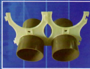
6" SS141 class 'B' pipe spacer