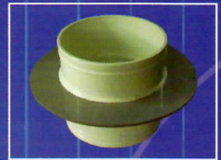
Puddle flange socket