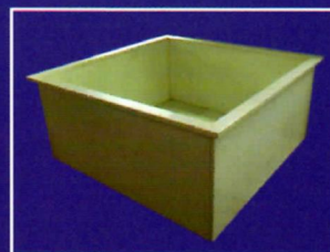
PP Water tank