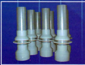
Fabricate reducing puddle flange