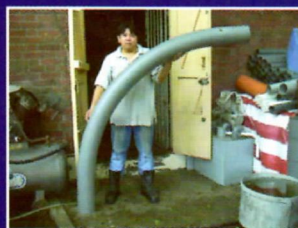
Long radius bend