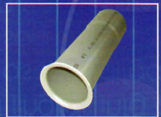
Bell mount socket