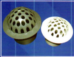
Dome grating 3" to 8" fabricate 10" to 12"

We fabricate the following items at all size & standard and also base on project drawing specification.