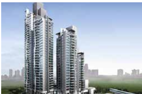
Concourse Skyline - Singapore

Since the 80's, millions of connections have been created in Austria, Australia, Canada, Czech Republic, Denmark, Great Britain, Hong Kong, Hungary, Germany, Japan, Malaysia, Netherlands, New Zealand, the Philippines, Poland, Portugal, Singapore, Spain, Switzerland, Taiwan, Thailand and the USA by using REHAU compression sleeve jointing technology. The RAUTITAN his 311 system has been proven to meet all the requirements of the plumbing trade.