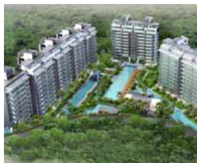
Parvis Residence - Singapore