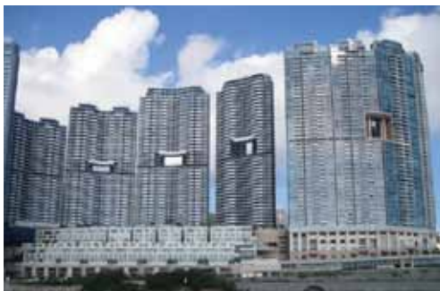
Bel-Air No. 8 - Hong Kong, China