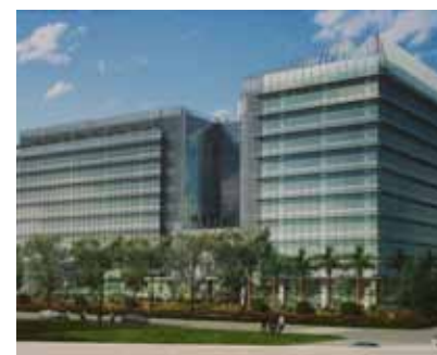
Hyflux Innovation Centre - Singapore