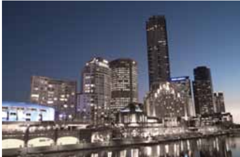
Eureka Tower - Melbourne, Australia