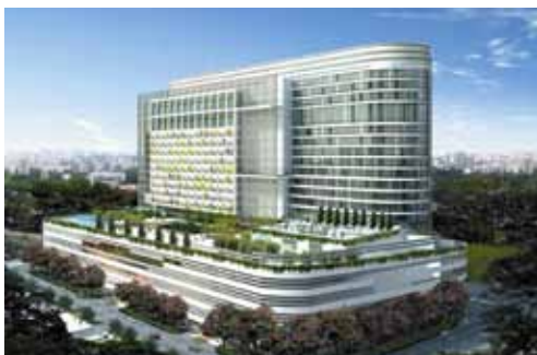
Connexion Farrer Park Hospital - Singapore